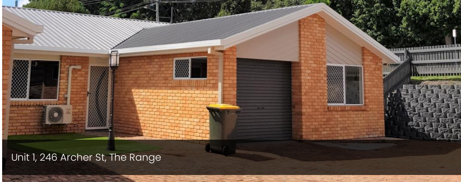
Unit 1, 246 Archer St, The Range