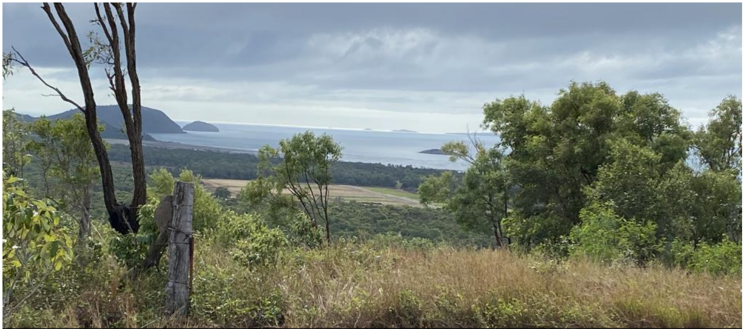
422 Kinka Beach Rd, Kinka Beach