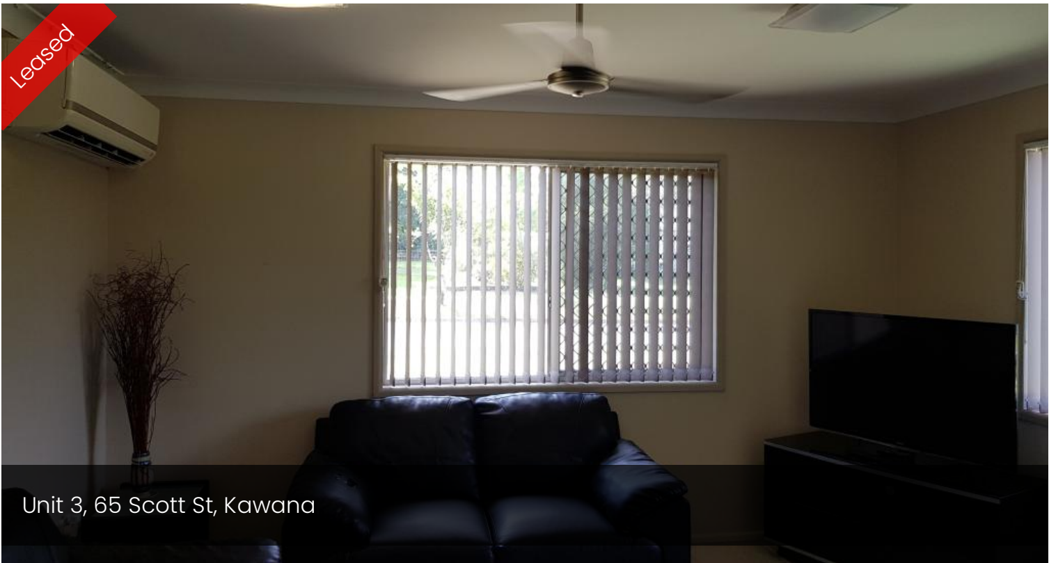
Unit 3, 65 Scott St, Kawana