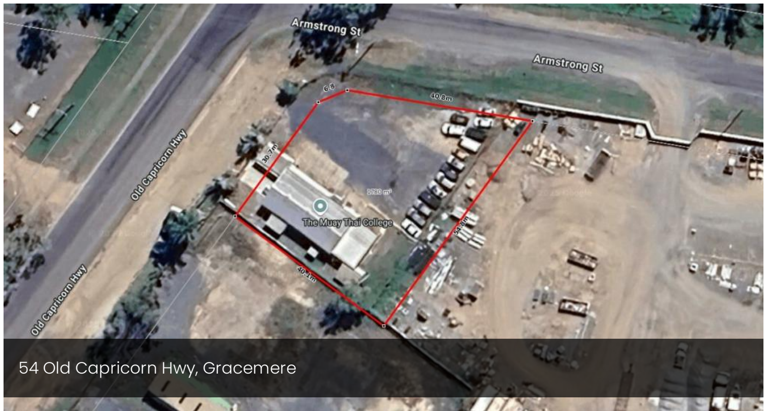
54 Old Capricorn Hwy, Gracemere