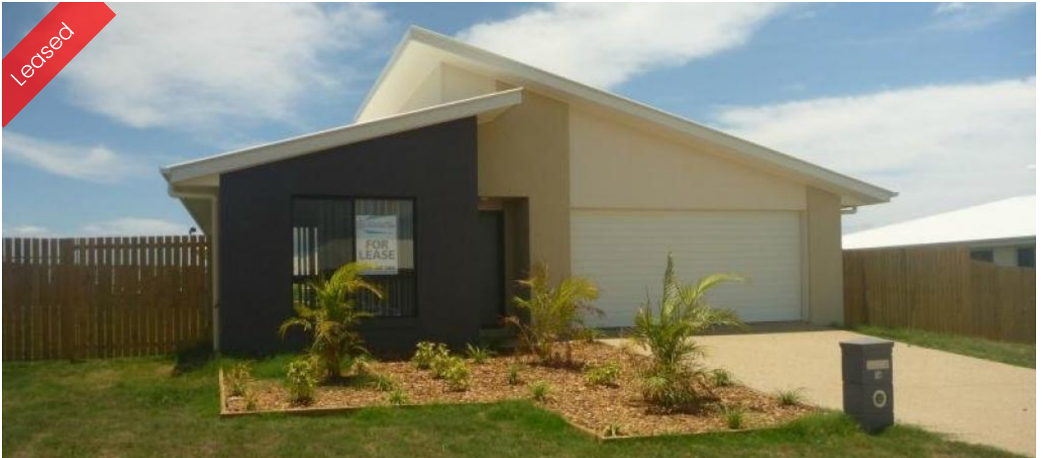
14 Gracemere Greens, Gracemere