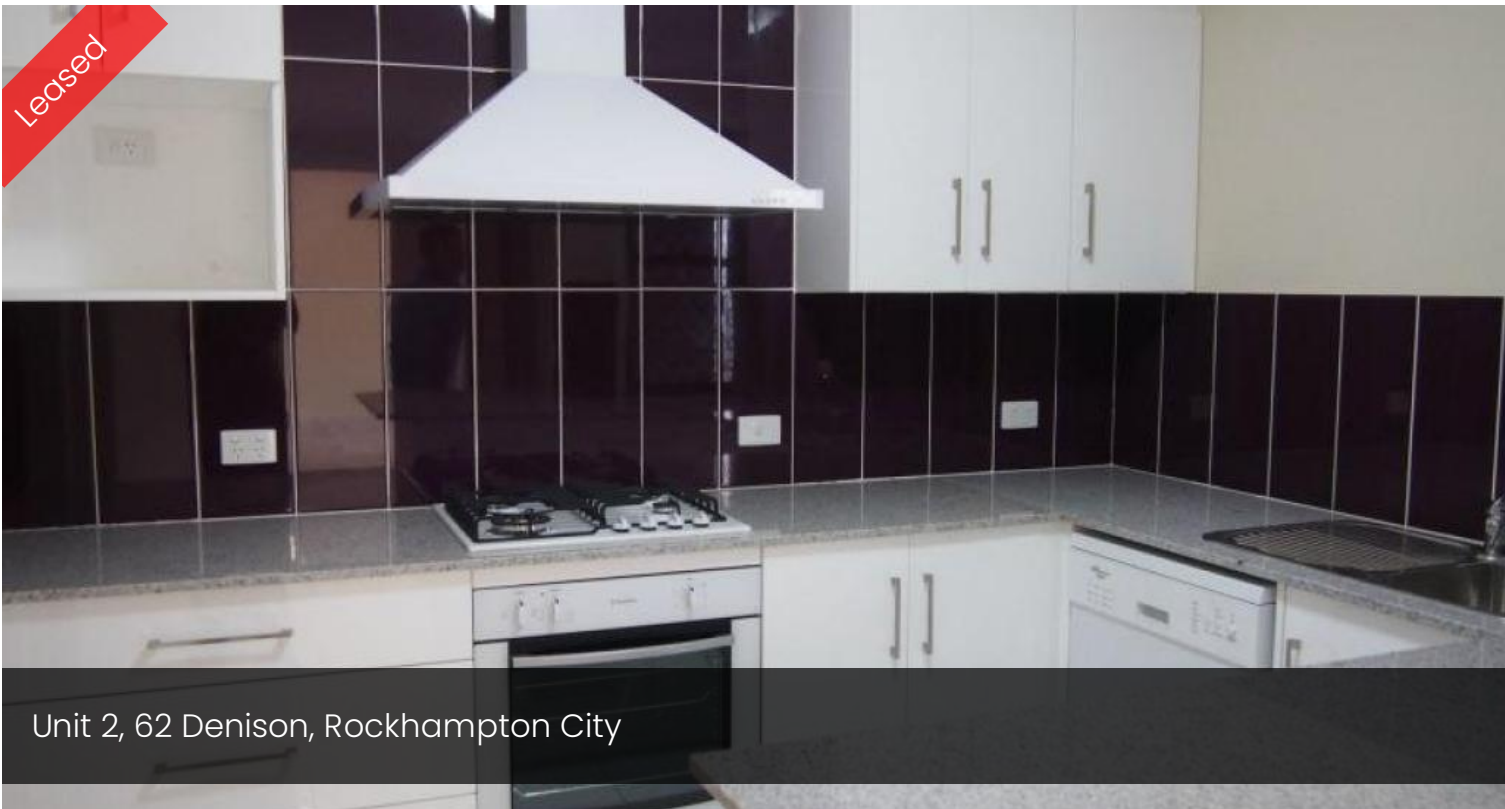
Unit 2, 62 Denison, Rockhampton City