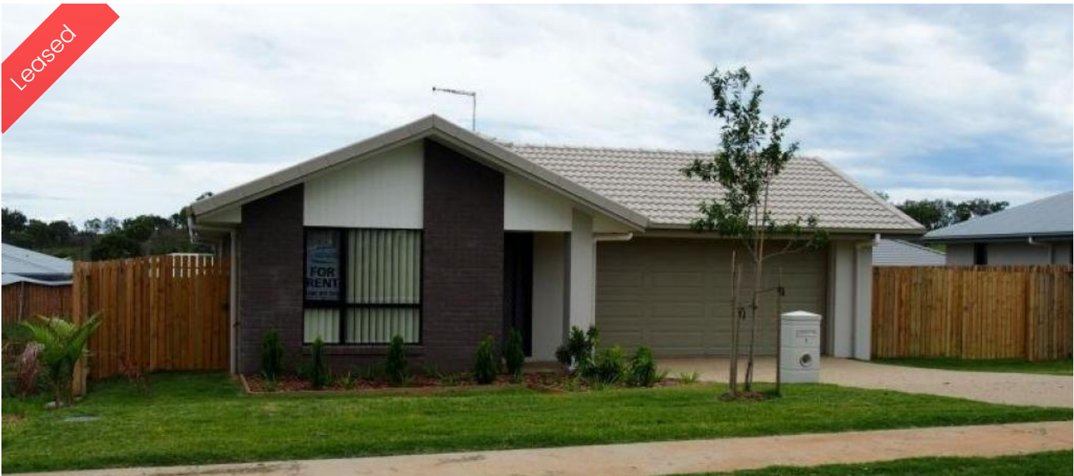
5 Virginia Drive, Parkhurst