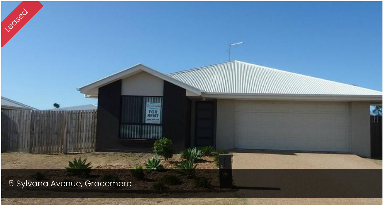
5 Sylvana Avenue, Gracemere