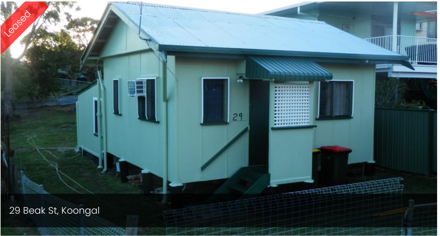
29 Beak St, Koongal