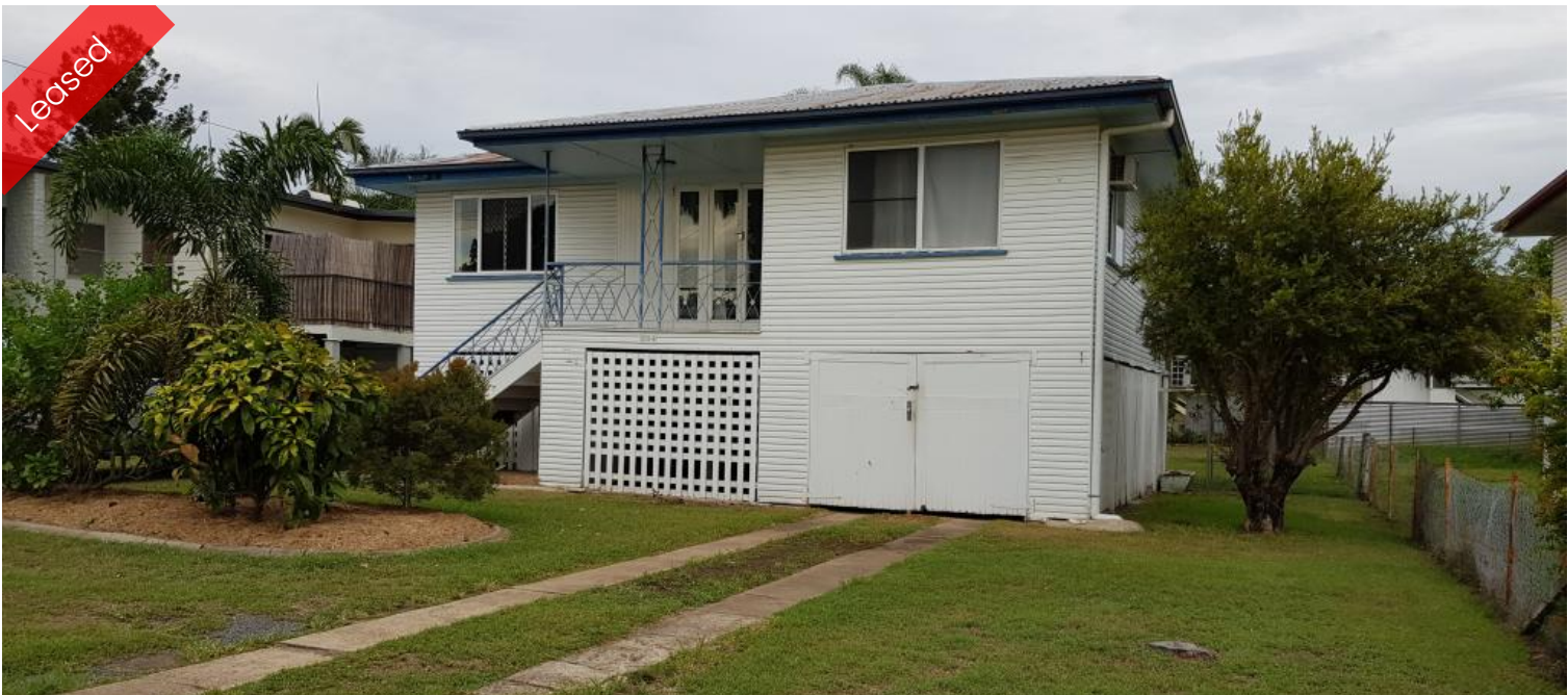
254 Diplock St, Berserker