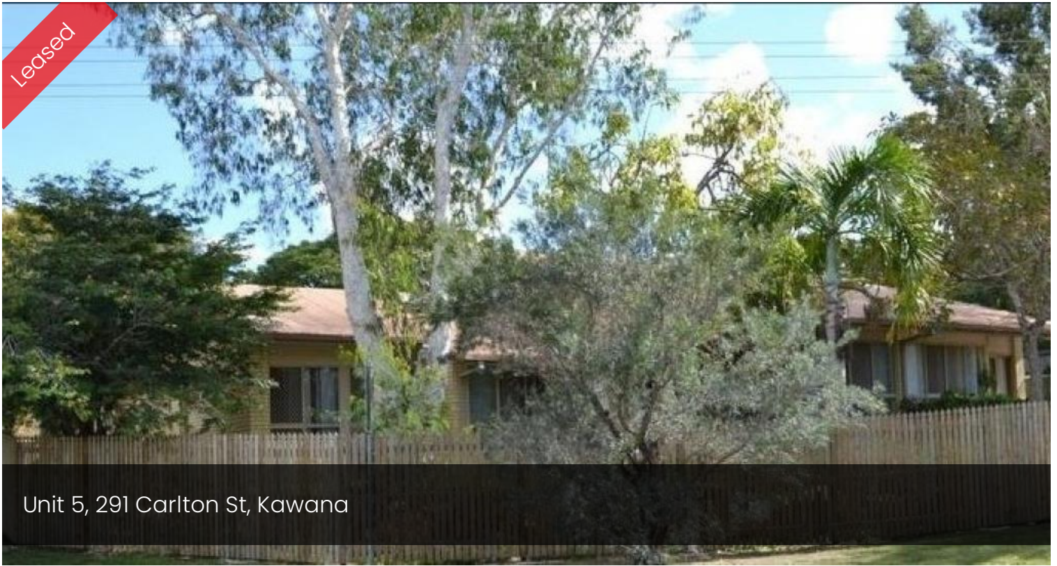
Unit 5, 291 Carlton St, Kawana