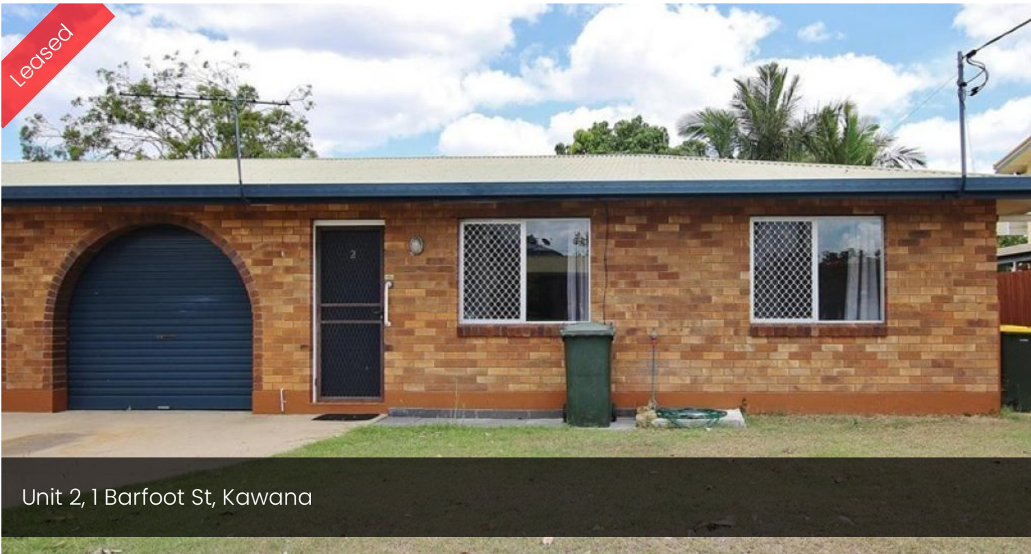
Unit 2, 1 Barfoot St, Kawana