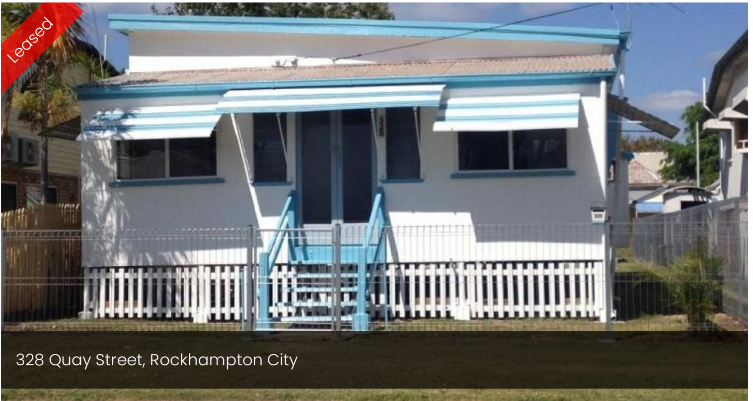
328 Quay Street, Rockhampton City