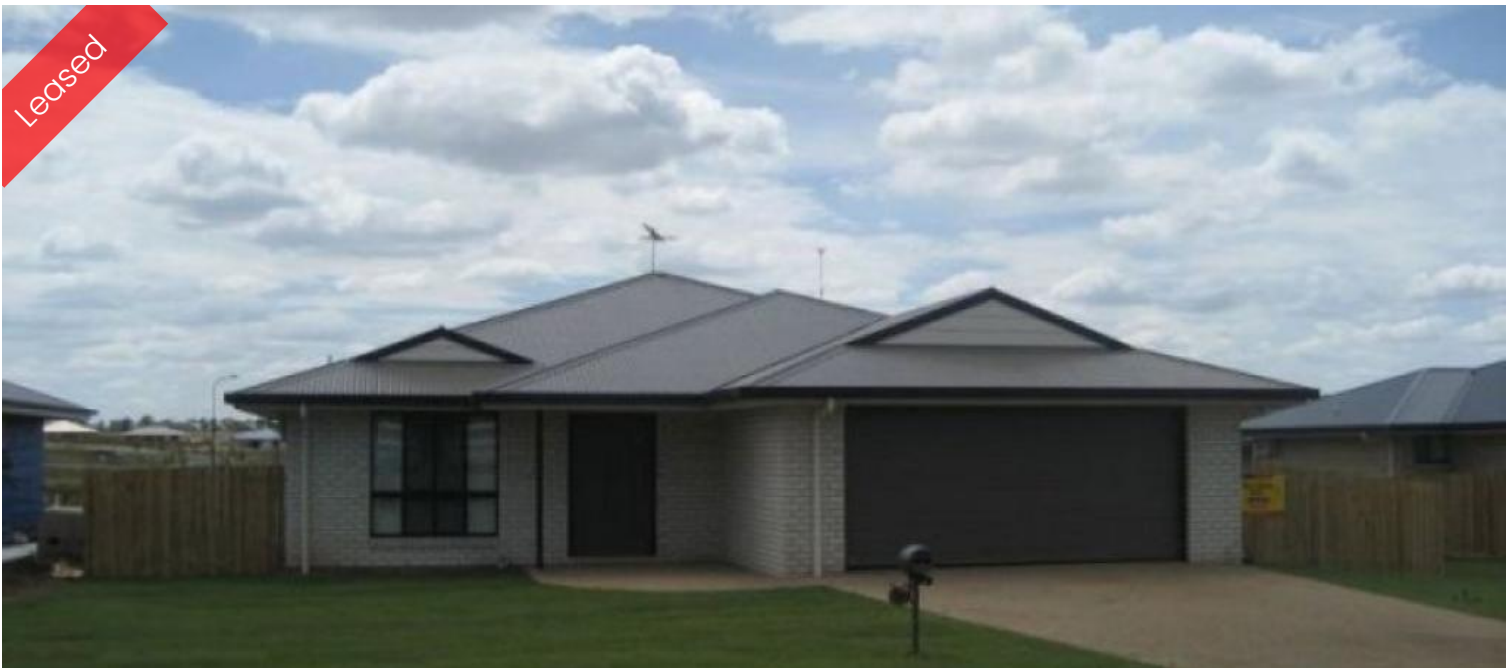
10 Joseph Street, Gracemere